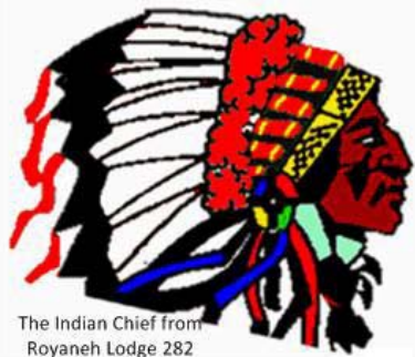
The Indian Chief from Royaneh Lodge 282