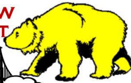
The Golden Bear from Machek N'Gult Lodge 375